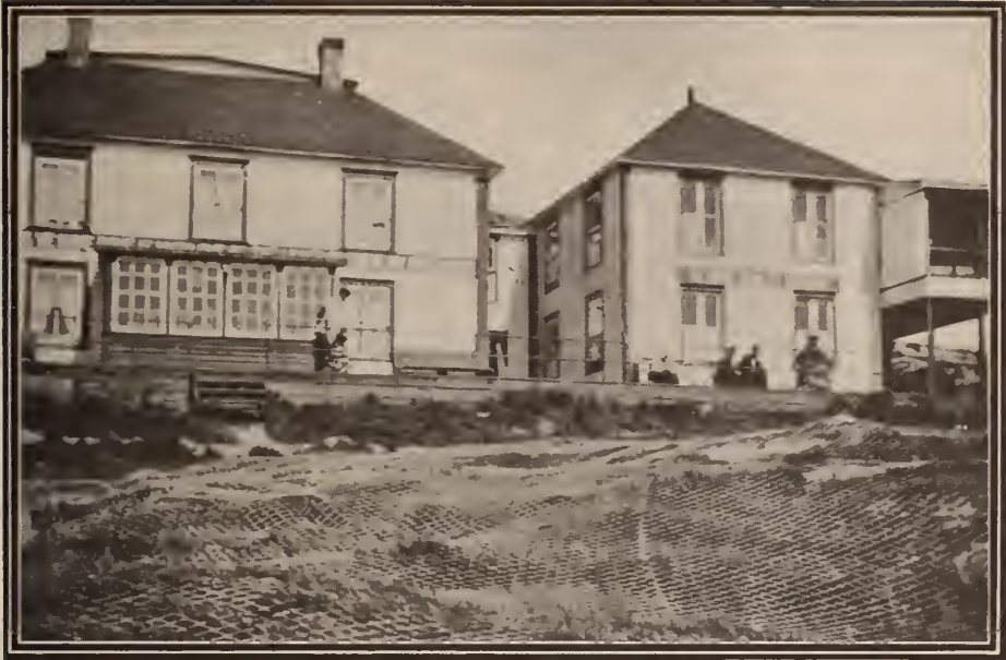
ONE OF DR. GRENFELL'S HOSPITALS AT BATTLE HARBOR, LABRADOR

Over the door of the hospital in large letters are these words which fairly describe the spirit of the work: "Inasmuch as ye have done it unto one of the least of these, my brethren, ye have done it unto me." When one realizes that many a man and woman and child has been saved from suffering and been introduced to the practical Christianity of Christ, it confirms our faith in Him who healed the sick. At Indian Harbor, farther north, is another hospital not so large as the one at Battle Harbor, but doing most excellent work. By locating a hospital farther north Dr. Grenfell has made these places accessible to the fishermen. For those who venture even farther along the northern shore the mission steamer affords help; for every summer, manned with her crew of physicians and sailors, the steamer makes the journey along the coast, ministering to the sick as the boat calls in at the many fishing harbors that dot the coast. In cases where it